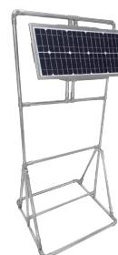
SolarPak Charger (optional)