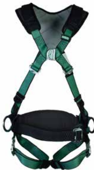
V-FORM +, Back/Chest/Hip D-Ring, with waist belt, Bayonet buckles (P/N 10206055)