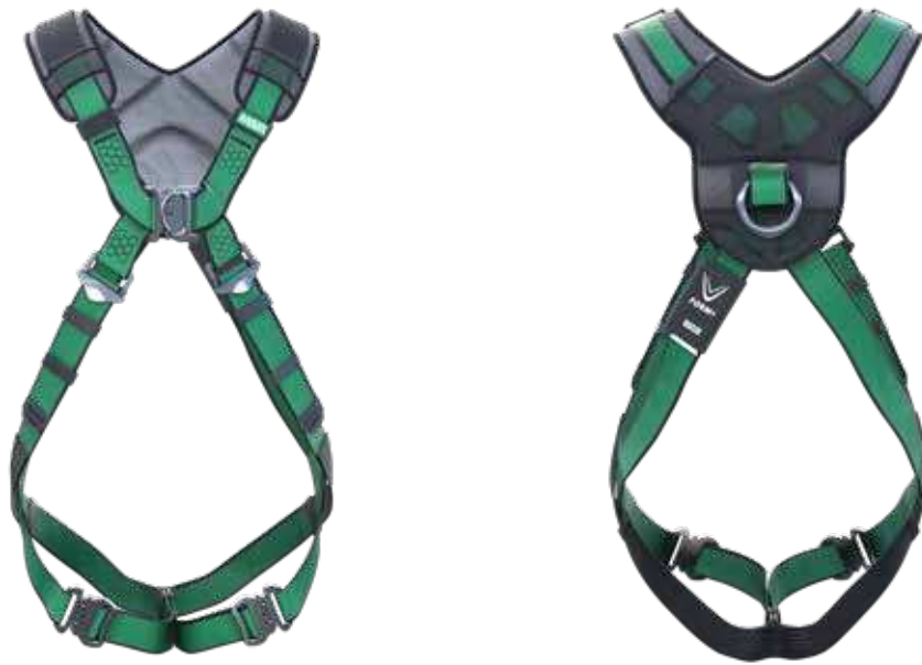
V-FORM +, Back/Chest D-Ring, Bayonet buckles (P/N 10206052)