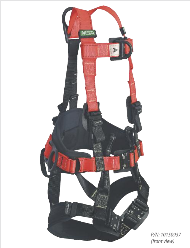
P/N: 10150937 (front view)