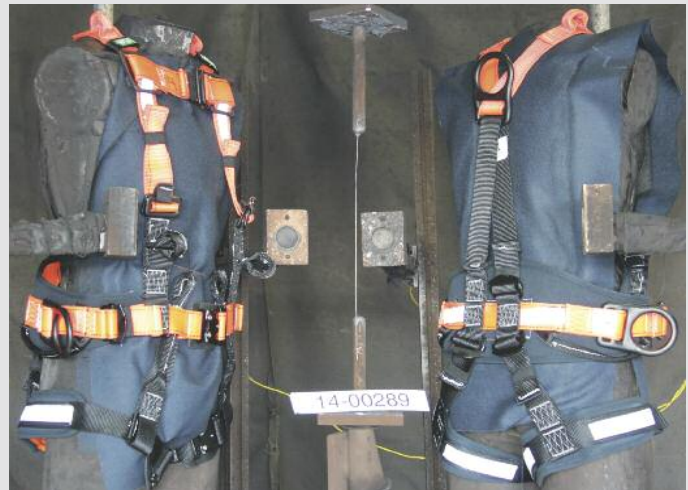
Before Arc Test