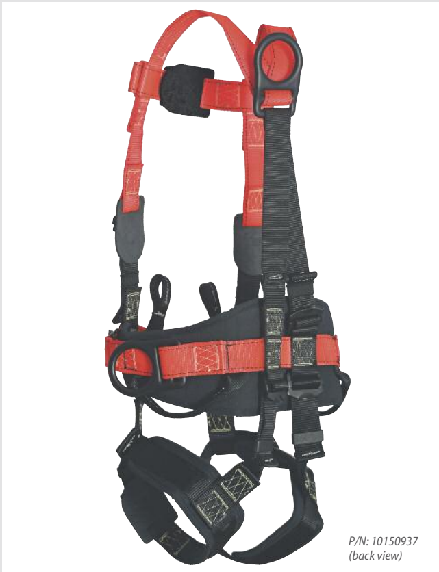
P/N: 10150937 (back view)