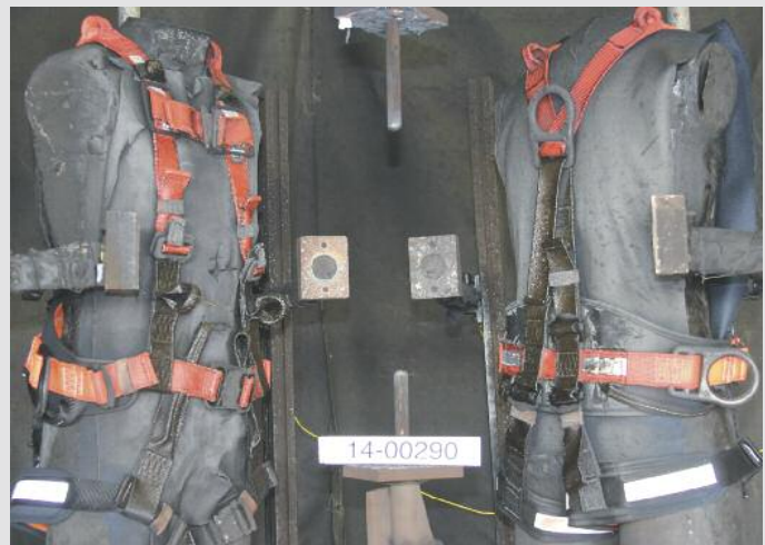
After Arc Test