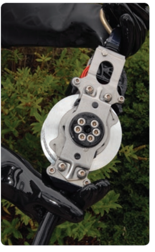
Can withstand contaminants