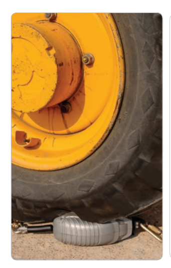
Impact resistant case

Tested operational temperature range: -30°C to +54°C.