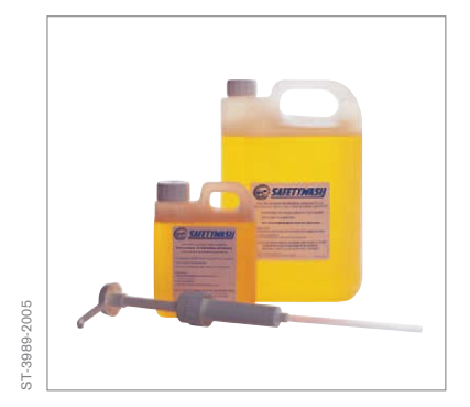
Safety Wash 1 litre Dispenser, 1 litre Refill, 5 litre Dispenser, 5 litre Refill