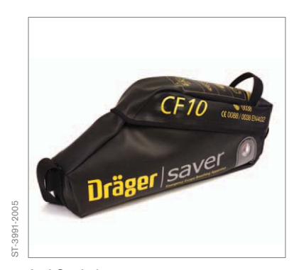
Anti-Static bag 10 min, 15 min