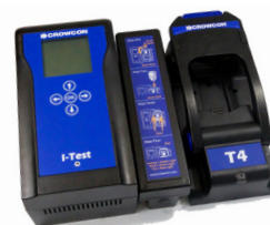
I-Test Easy automated bump testing and calibration solution