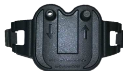
Aspirator plate Sample atmosphere prior to entry