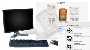
NEW Portables Pro 2.0 Software For easy configuration and servicing