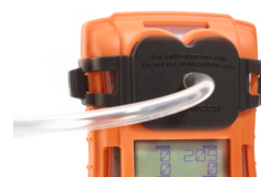
Bump/calibration plate To apply test gas to T4