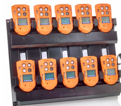
10 way charger For charging and storing your T4 fleet