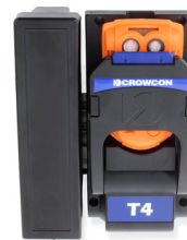
Vehicle charger Effective charging and storage whilst travelling