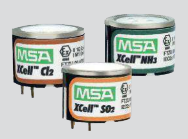
MSA XCELL SENSORS are a breakthrough in chemical and mechanical sensor design, enabling faster response and span calibration times.

The ALTAIR 5X is fully compatible with the MSA GALAXY GX2 Automated Test System and MSA Link™ Pro and MSA Link Software to efficiently manage your entire fleet.