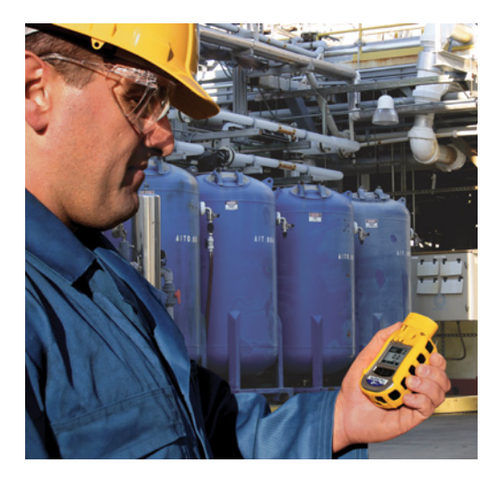
Worker exposure monitoring with ToxiRAE Pro PID at a PVC plant